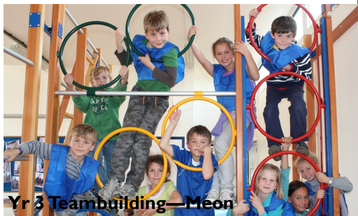
Yr 3 Teambuilding—Meon